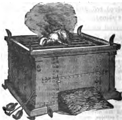
THE BRAZEN ALTAR. by Google

It will be noticed that the three entrance passages, viz. the "Gate" into the "Court," the "Door" into the "Holy" and the "Vail" into the "Most Holy," were of the same material and colors. Outside the Tabernacle and its "Court" was the "Camp" of Israel surrounding it on all sides at a respectful distance.