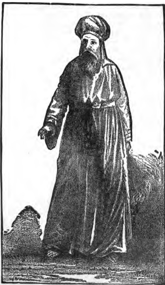
A PRIEST—IN LINEN GARMENTS