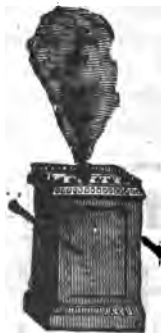
THE "GOLDEN ALTAR."

Opposite the "Table of Shew-bread" stood the "Candlestick," made of pure gold, beaten work (hammered