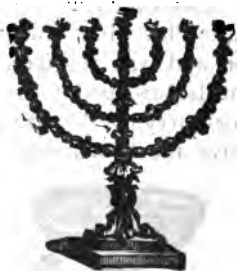
THE GOLDEN CANDLESTICK.

Within the Tabernacle, in the first apartment, the "Holy," on the right (north), stood the Table of "Shew-bread"—a wooden table overlaid with gold; and upon it were placed twelve cakes of unleavened bread in two piles, with frankincense on top of each pile. (Lev. 24:6, 7)