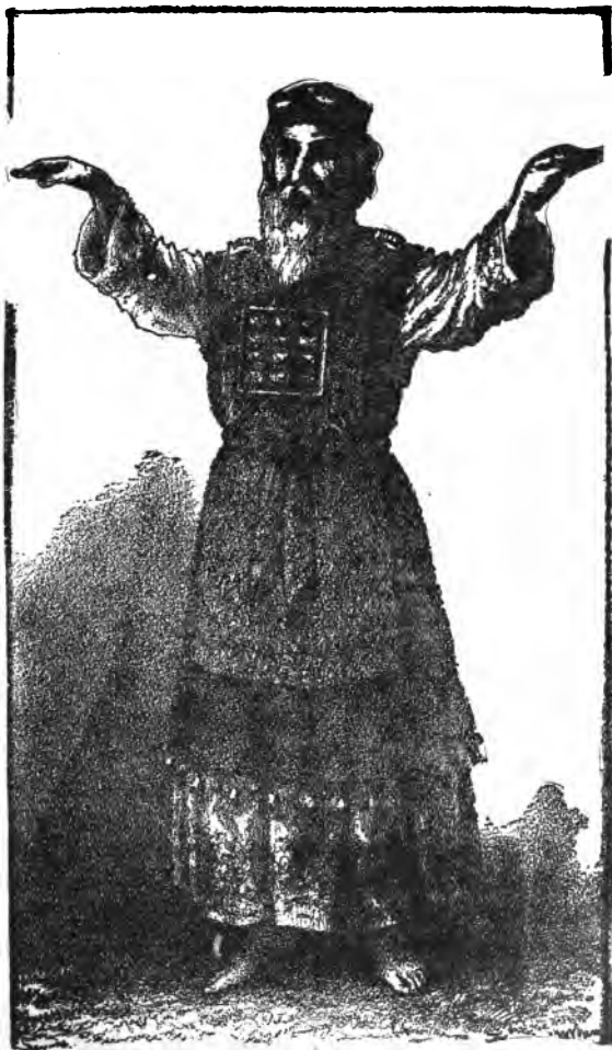
THE HIGH PRIEST IN ROBES TYPICAL OF CHRIST'S COMING GLORY.