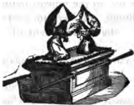
THE ARK OF THE TESTIMONY.

Farther on, close up to the "Vail," stood a small altar, of wood covered with gold, called the "Golden Altar" or "Incense Altar." It had no fire upon it except what the priests brought in the censers which they set in the top of this "Golden Altar," and then crumbled the incense upon it, causing it to give forth a fragrant smoke or perfume, which, filling the "Holy," penetrated also beyond the "second vail" into the Most Holy or Holy of Holies.